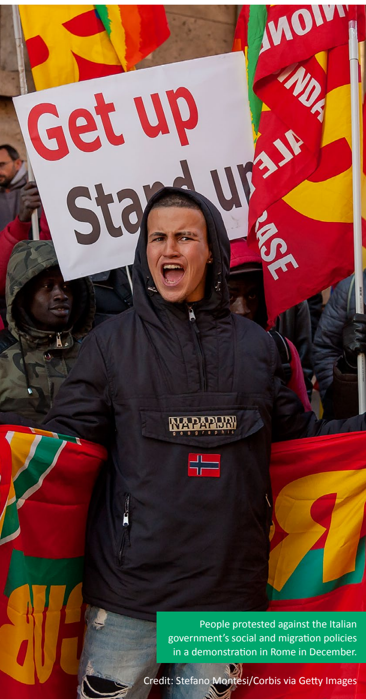
People protested against the Italian government's social and migration policies in a demonstration in Rome in December.