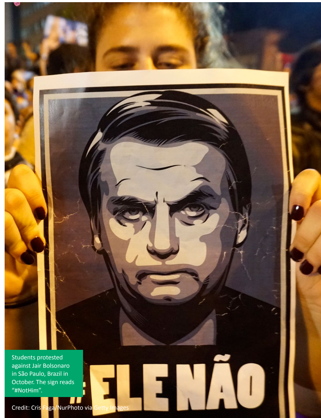
Students protested against Jair Bolsonaro in São Paulo, Brazil in October. The sign reads “#NotHim”.

But if the year offered some inspiring examples of people power claiming democratic freedoms, as well as some more troubling instances of right-wing populism dominating political space, it too often also provided moments when democratic freedoms were suppressed or stolen around elections. Too often, elections were not celebrations of democracy when democratic participation and dissent were at their highest, but times when participation and dissent were repressed. Too many times in 2018, elections were used by presidents and ruling parties as little more than a means to claim a renewal of their mandate and garner