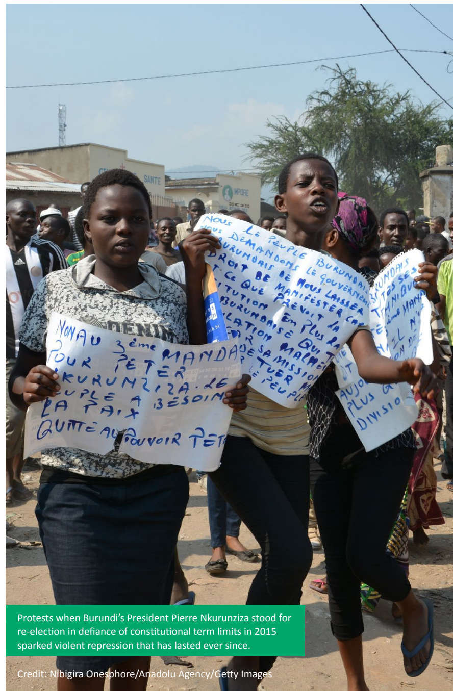
Protests when Burundi's President Pierre Nkurunziza stood for re-election in defiance of constitutional term limits in 2015 sparked violent repression that has lasted ever since.

In a fragile democracy like Burundi's, it is especially important to take into account the country's recent and painful unresolved past to evolve towards consensual governance. This is not the present case: the Nkurunziza regime has committed a number of serious crimes currently under investigation by the International Criminal Court (ICC) and continues to promote the law of force instead of the force of law.