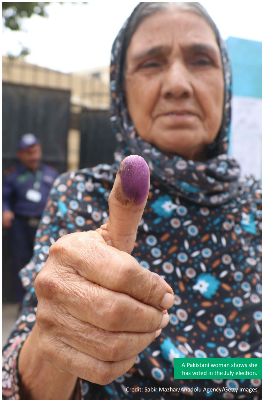
A Pakistani woman shows she has voted in the July election.