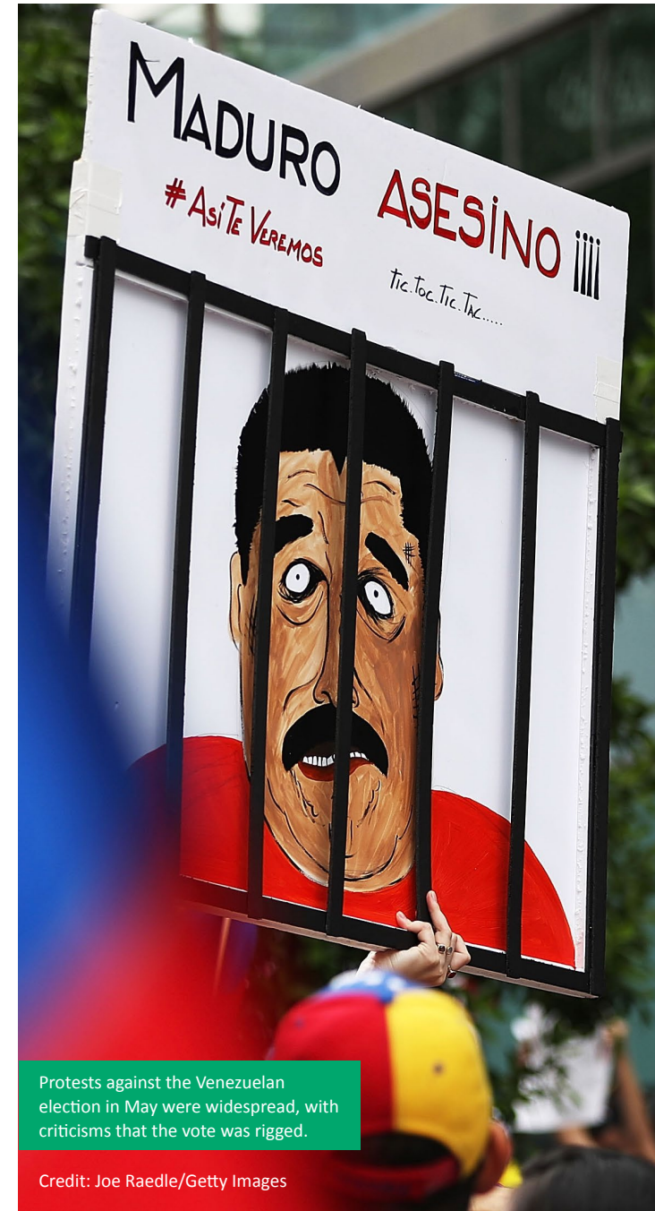
Protests against the Venezuelan election in May were widespread, with criticisms that the vote was rigged.

The dismal turnout of around 26 per cent, the lowest in history, signalled widespread disaffection at the denial of a real choice in the vote. Many opposition candidates were barred from running while others had been jailed or left the country to flee persecution. In a context where the presidency repeatedly overrides other institutions of governance and impunity for human rights abuses is widespread, the election was plagued by irregularities in timeline and process,