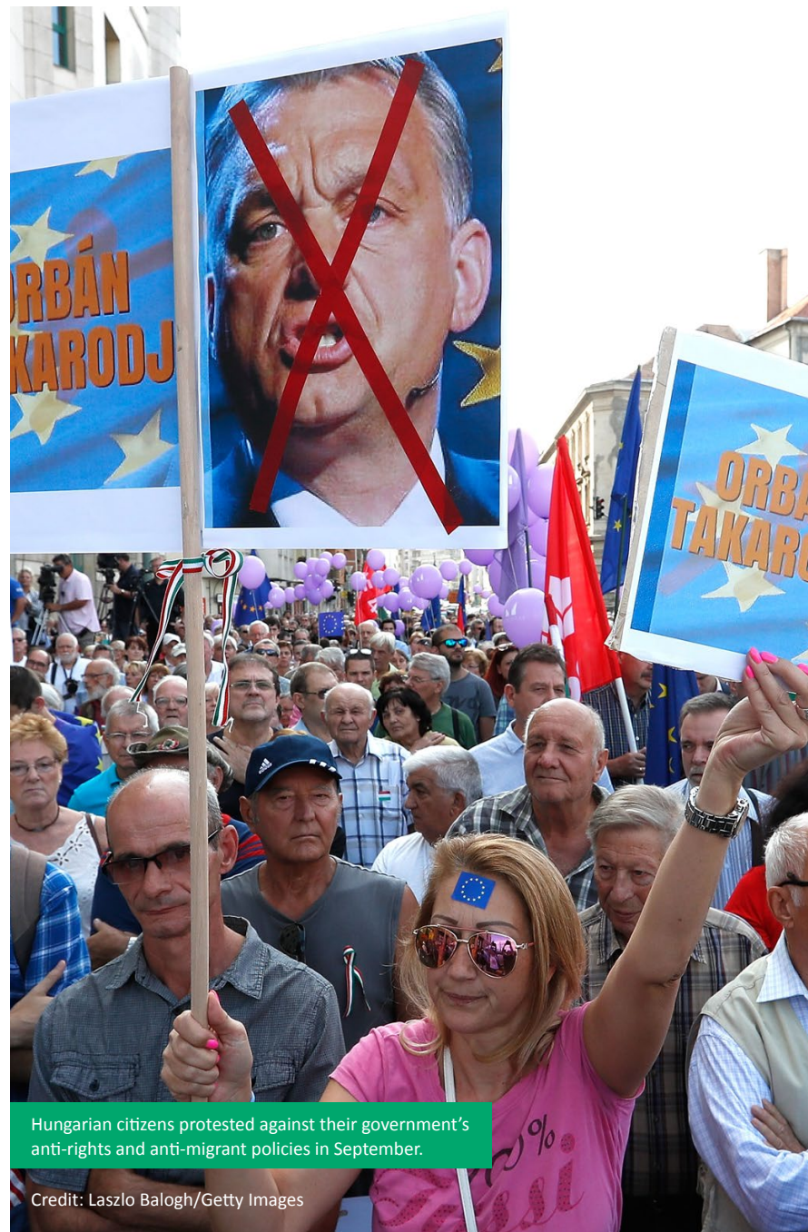
Hungarian citizens protested against their government's anti-rights and anti-migrant policies in September.

Next door in Austria , civil society is experiencing the impacts of a recent political shift. The coalition government that formed in December 2017 brought the right-wing populist and nationalist Freedom Party of Austria (FPÖ) into government alongside the centre-right Austrian People's Party.