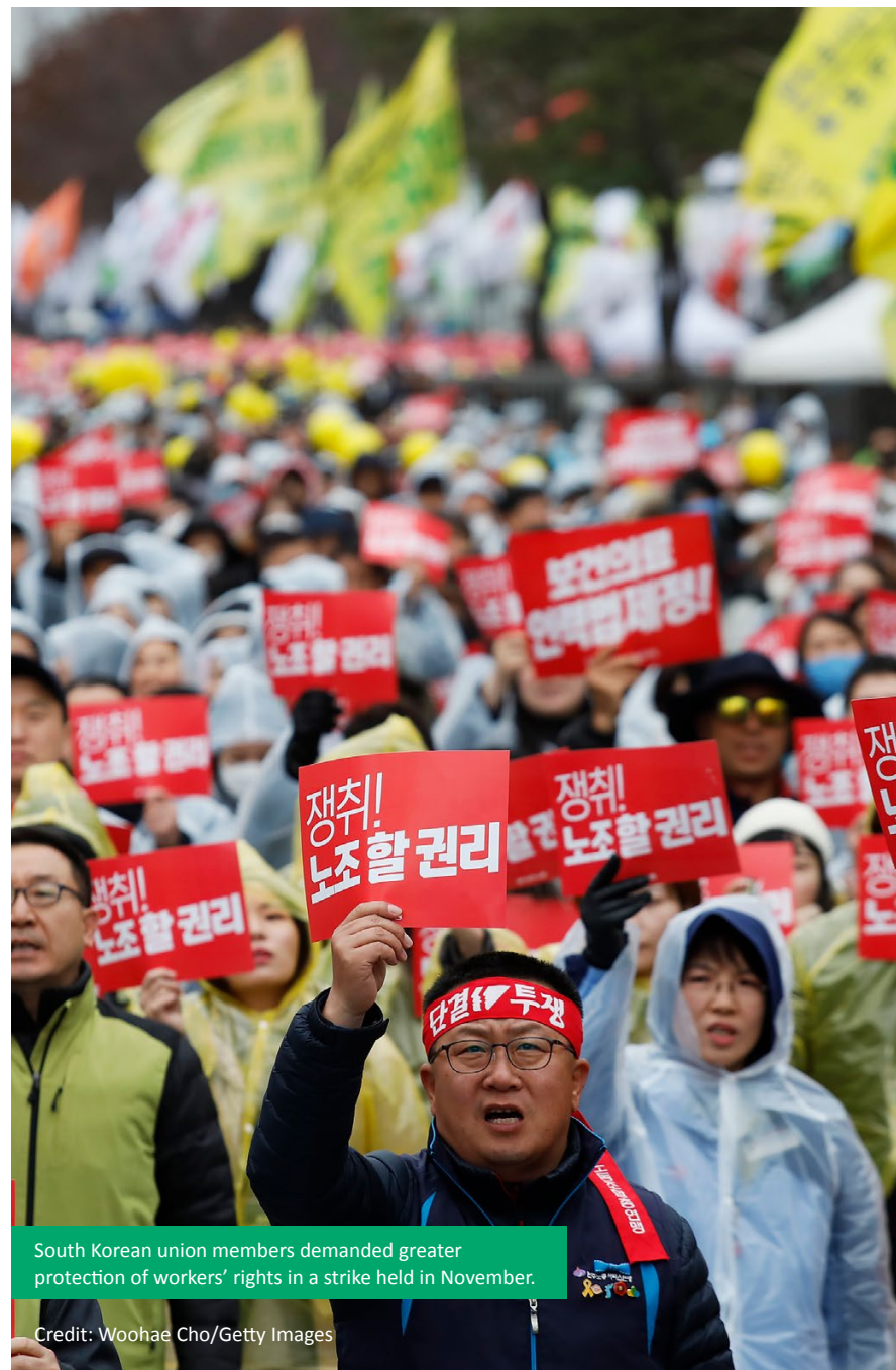
South Korean union members demanded greater protection of workers' rights in a strike held in November.

There are urgent and long-running issues that demand sustained civil society engagement, not least to realise the rights of women, LGBTQI