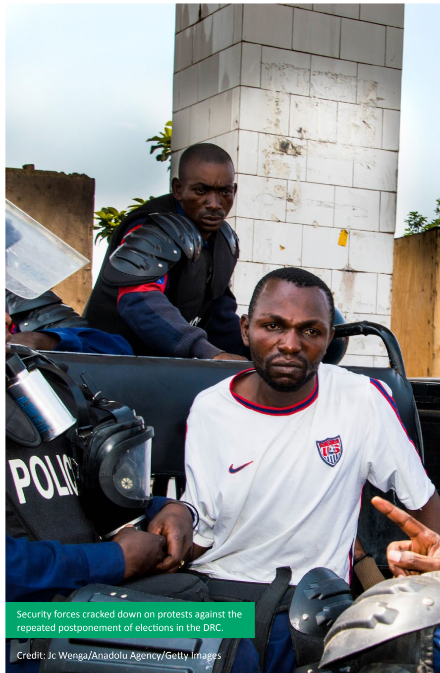
Security forces cracked down on protests against the repeated postponement of elections in the DRC.

Second, there is the fact that the results of provincial and national elections were also challenged in several provinces across the DRC. CENI proclaimed these results when most of the paper ballots remained in the various localities where votes had been