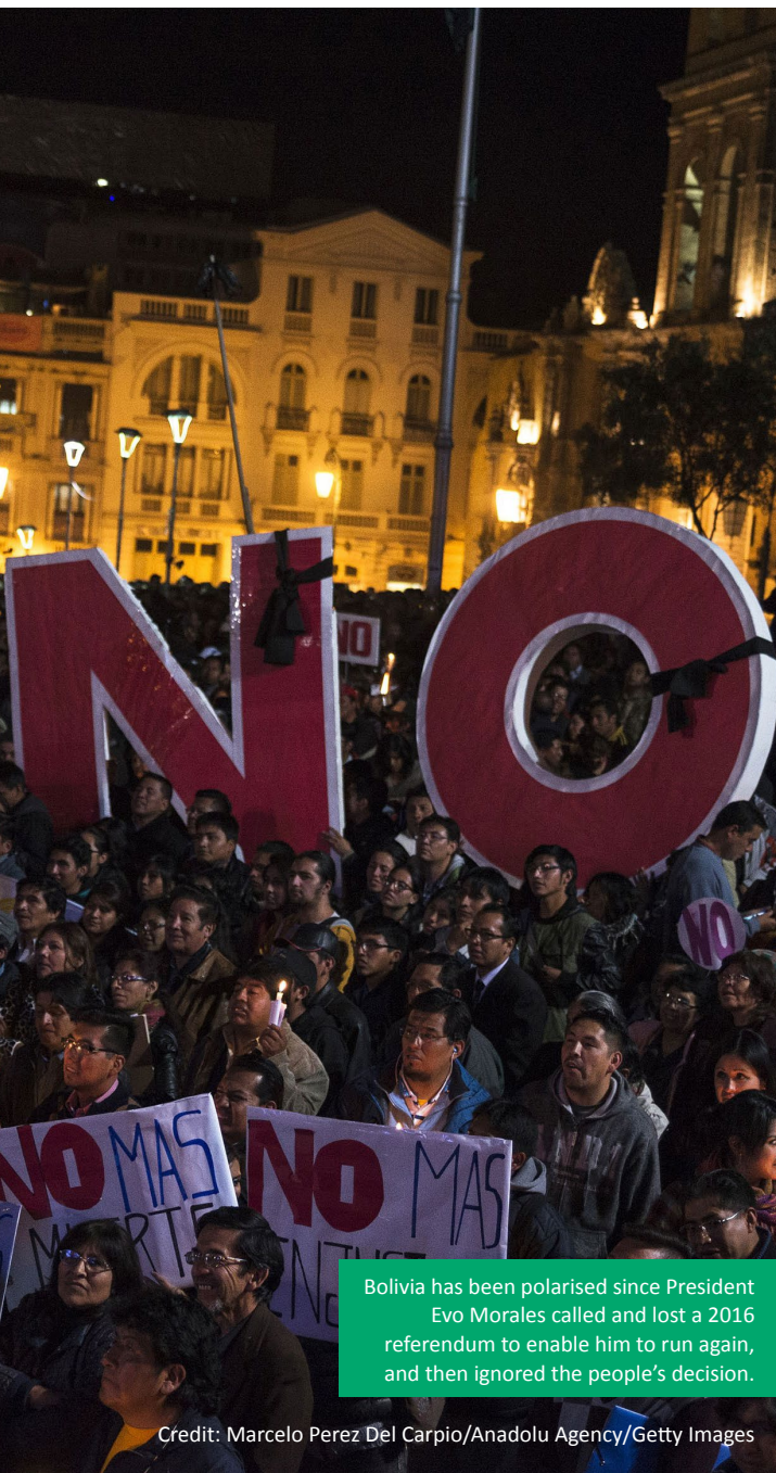
Bolivia has been polarised since President Evo Morales called and lost a 2016 referendum to enable him to run again, and then ignored the people's decision.