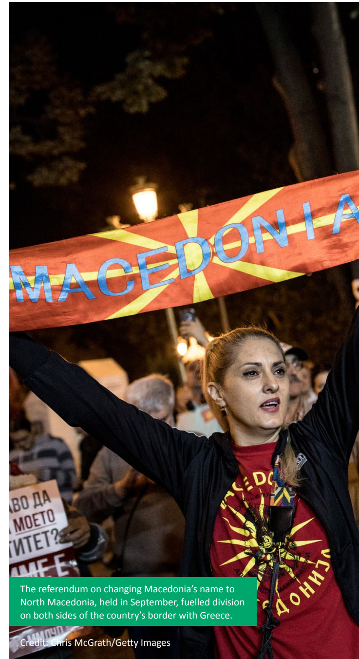
The referendum on changing Macedonia's name to North Macedonia, held in September, fuelled division on both sides of the country's border with Greece.

On the streets, the agreement revealed antipathies on both sides of the border. A large protest against the name change proposal was held in Macedonia's capital, Skopje, in February, involving