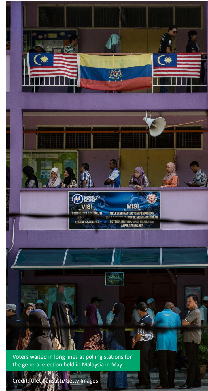
Voters waited in long lines at polling stations for the general election held in Malaysia in May.

Challenges for excluded groups and the civil society that asserts their rights, including refugees, LGBTQI people and indigenous minorities, remained largely unaddressed. There were still violations of fundamental freedoms. In September eight students were arrested during a Malaysia