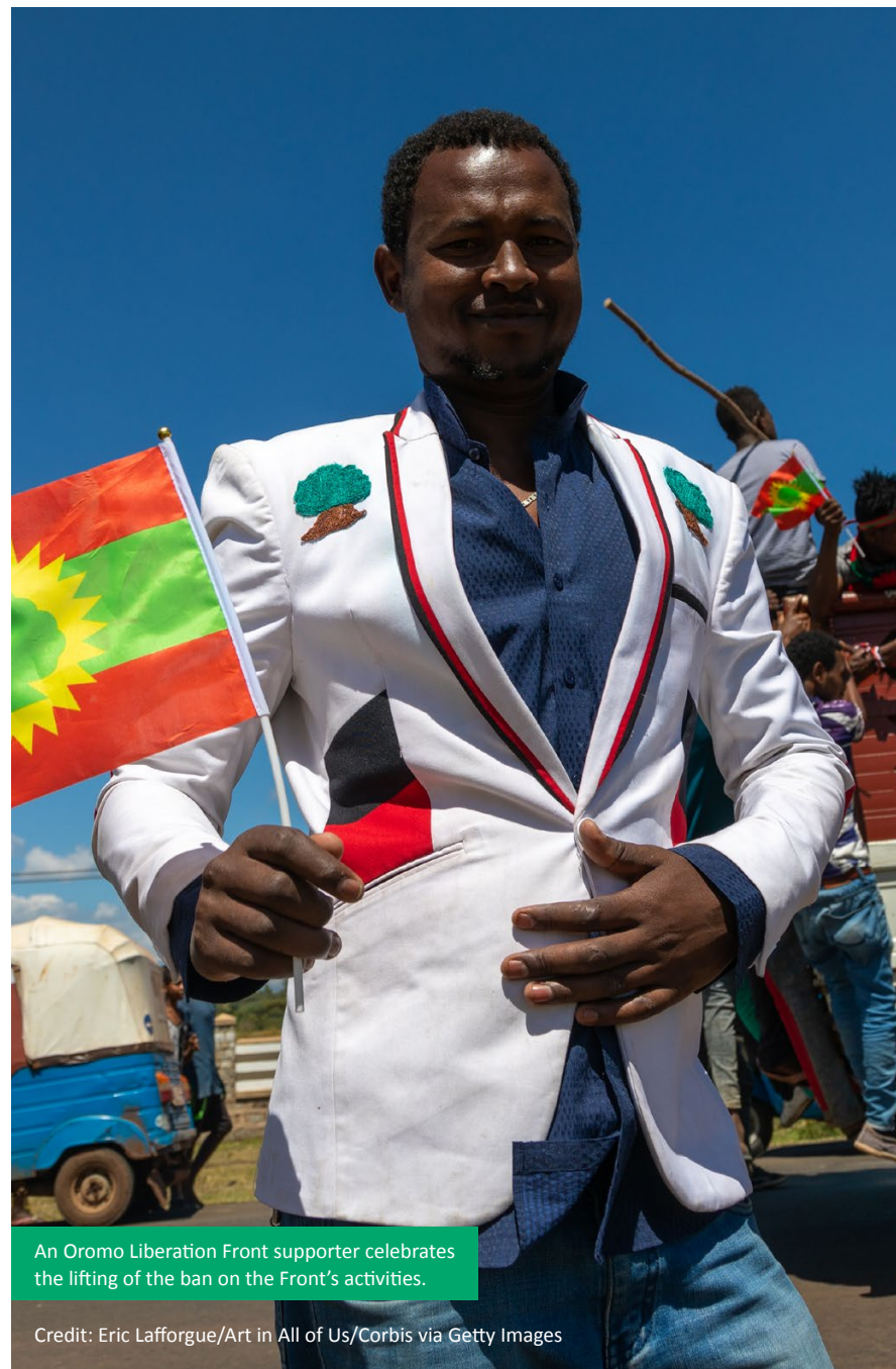
An Oromo Liberation Front supporter celebrates the lifting of the ban on the Front's activities.

These protests met the iron fist of security forces that killed and wounded the largely peaceful protesters. The provisions of the Anti-Terrorism Proclamation were used to arrest and detain arbitrarily, charge and convict the perceived leaders of the protests. However, this did not deter the demand for freedom