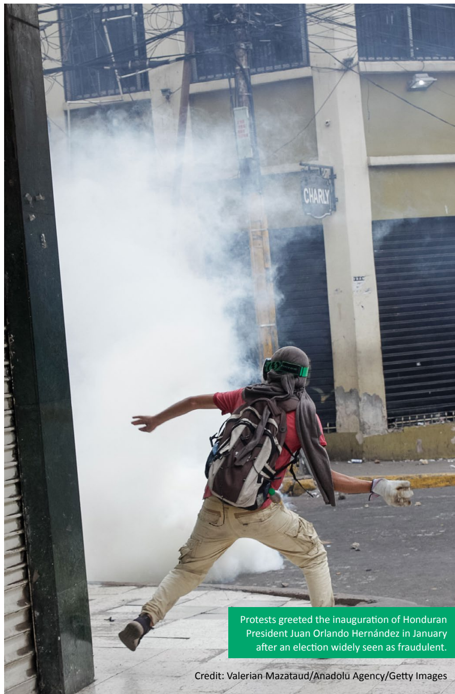
Protests greeted the inauguration of Honduran President Juan Orlando Hernández in January after an election widely seen as fraudulent.