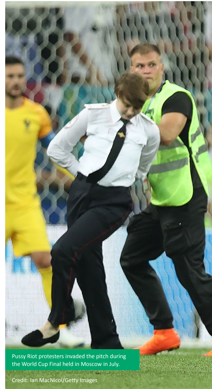
Pussy Riot protesters invaded the pitch during the World Cup Final held in Moscow in July.

President Putin can now be confident that he has another six years to further shape the country in his image, during which time he might either handpick his successor or convert his reign into a lifetime presidency. Protests will continue to demand a better Russia, but can be expected to face further repression from a regime buoyed by the election result.