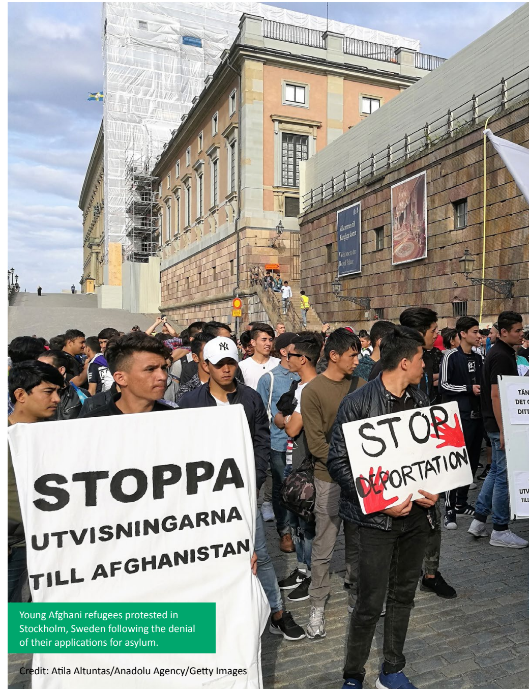
Young Afghani refugees protested in Stockholm, Sweden following the denial of their applications for asylum.

Some analysts say that the Sweden Democrats have become popular because the other parties in parliament have tried to